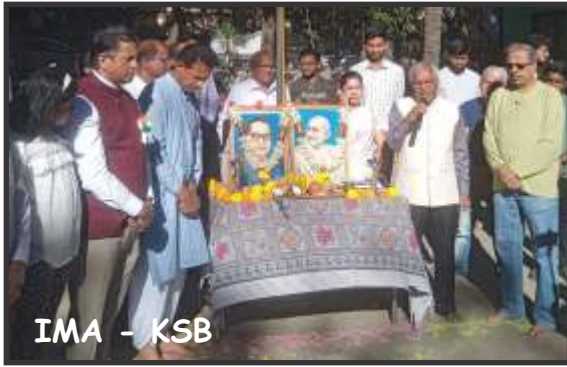
IMA - KSB